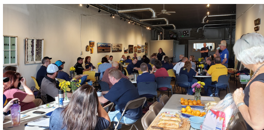
Trinidad State employees participate in professional development during the annual in-service (2019)

Credit courses toward our many degrees or certificates, non-credit live or online options, or training customized to meet the specific needs of your business. Call Donna at 719-846-5724 to discuss your needs today.