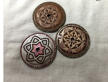
Leather Drop Spindles made on the Glowforge