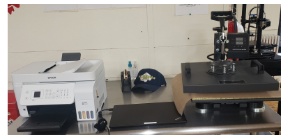
Sublimation Printer and Heat Press for t-shirts, cups, and hats. A 34" vinyl cutter is also available