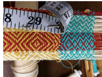
Come Weave on one of our Louet Erica 50cm, 4 shaft, table looms

A makerspace is a collaborative work space for making, learning, exploring and sharing that uses high tech to no tech tools. These spaces are open to kids, adults, and entrepreneurs and have a variety of maker equipment. Not interested in tech? We also have a wide variety of artistic supplies, tools and equipment.