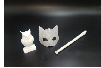
3D printed items