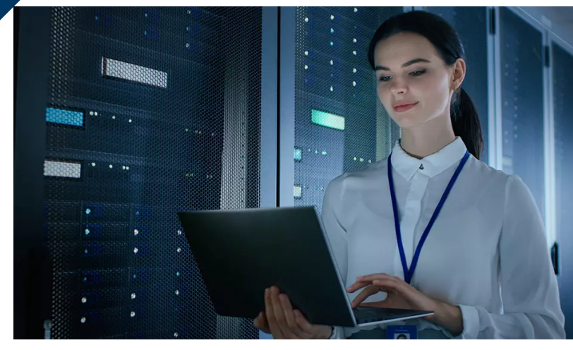
CompTIA A+ Certification Training (Vouchers Included)

Contact Donna at 719-846-5724 or email donna.haddow@trinidadstate.edu for complete information.